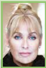
Carol Royle Actress