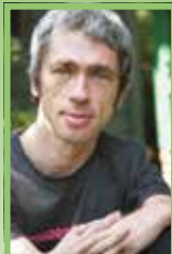
Mat Fraser Actor and thalidomider