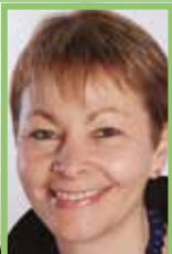
Caroline Lucas MP Green Party