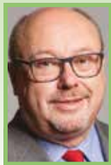
Grahame Morris MP Labour

“ What other area of science still relies on the flawed methods of 50 years ago? We must move safety testing into the 21st century – for all our sakes ”